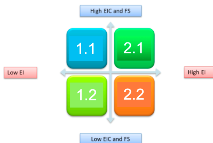
Figure 2. Representation of the average scores in EI, EIC, and family support (FS) in accordance with the groupings of the PCA projection.

We established a Cartesian axis as a function of the results in which the projections yielded by the PCA are found (Figure 2). We then considered the number of subjects present in each of the established groupings and the average scores of the variables in use, the family interest in their child becoming entrepreneurial and the family support that would be given if the young person decided to become an entrepreneur, discriminating and dividing the group into a larger number of individuals. Therefore, we found that group 2.1 obtained high results for both EI, EIC, and FS, group 2.2 obtained high results for EI and low results for EIC and FS, and group 1.2 had low results for both EI, EIC, and FS.