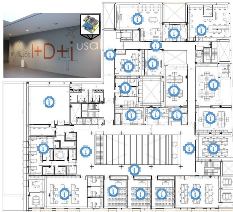
Figure 2. A map of the smart building used in the case study. The blue symbols in the figure are the positions in which the IoT devices are placed; they collect temperature values.

To test the proposed stability criterion, we have chosen a smart building. The chosen smart building is one of the buildings of the University of Salamanca; the R&D building, located on Espejo Street. This building is a center of reference for the region of Castilla y Leon, both nationally (Spain) and internationally. Built between 2010 and 2014, 25 million euros have been invested in its building and equipment. It implements the latest energy efficiency technologies and techniques. The building has more than 13,000 square meters distributed over six floors, three of which are lower ground. Due to the size of the building and the large number of people that work there (more than 250 people), it is difficult to monitor and control its indoor temperature throughout the year. For this reason, the building was an ideal place for conducting our case study. To monitor and control the temperature in the smart building a total of 25 IoT nodes were deployed. The IoT devices were placed over a mesh in the smart building. This was done with the help of laser levels, which made it possible to place the IoT devices vertically one in every section of the building. The smart building where the case study was deployed is shown in Figure 2.