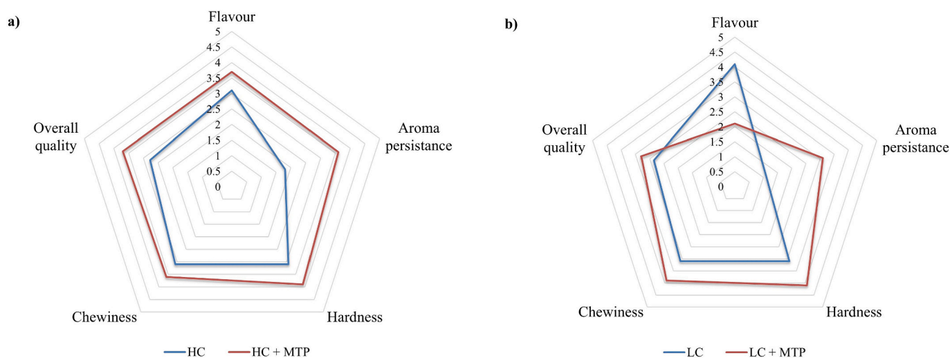
Fig. 2. Sensory evaluation of sugar-free honey (a) and liquorice (b) chewing gum with or without propolis powder (5 was Excellent and 1 was not satisfactory). HC: Honey Chewing Gum; LC: Liquorice Chewing Gum; MTP: Microencapsulated Tunisian Propolis.

The panelists concluded that honey flavoured chewing gums made with microencapsulated propolis contained no sensory flaw that could jeopardize their commercialization.