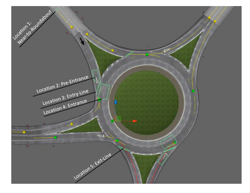
Figure 3. Locations of interest inside and outside a roundabout.

With regard to the eye pupil size, we proposed a one-sided alternative wherein the median pupil dimeter (PD) under distracting conditions was higher than that under non-distracting conditions: