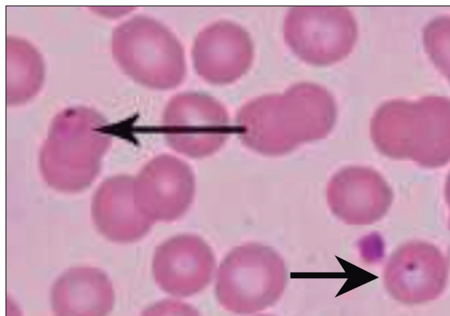
Fig. 1. Smear in which red blood cells parasitized by P. falciparum trophozoites are observed.

bilirubin, 1.99 mg/dl of creatinine, 25 UI/l of amylase, 165 mg/dl procalcitonin. In the ultrasonography acalculous gallbladder disease with thin walls can be observed, without any other important discoveries. As he is diagnosed with sepsis accompanied by hematologic, hemodynamic and hepatic kidney failure, the patient is admitted to the Intensive Care Unit. Because it is suspected that he has malaria, a smear is carried out in this unit. As a result, some forms are objectified, which are compatible with Plasmodium falciparum (Fig. 1), with an index of > 21% parasitemia. Almost two weeks after the patient's admission to the Intensive Care Unit, he evolves poorly. For this reason, an upper digestive endoscopy is requested, in which one can observe a segmental area of the second part of the edematous duodenum, possibly related