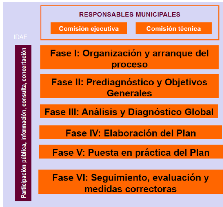
(Fig. 1. Phases of the SUMP Spanish Guidelines)