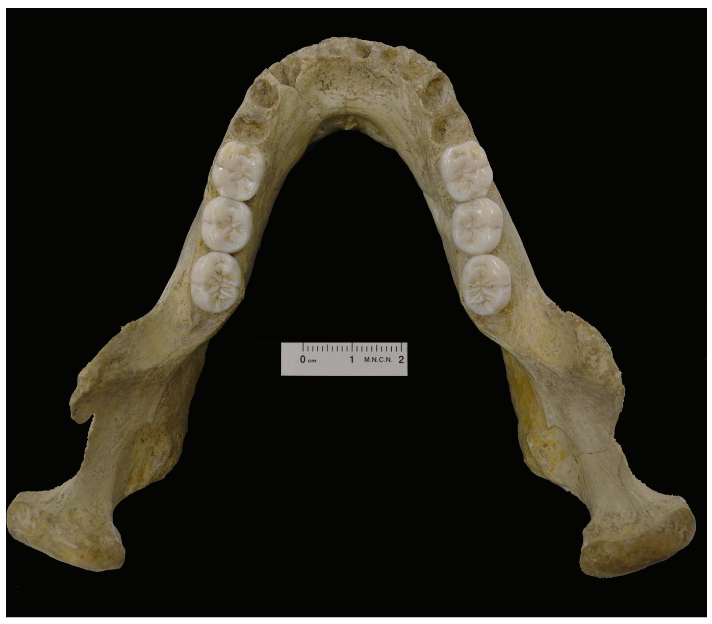
Fig 1. Upper view of the Montmaurin-LN mandible.

https://doi.org/10.1371/journal.pone.0189714.g001