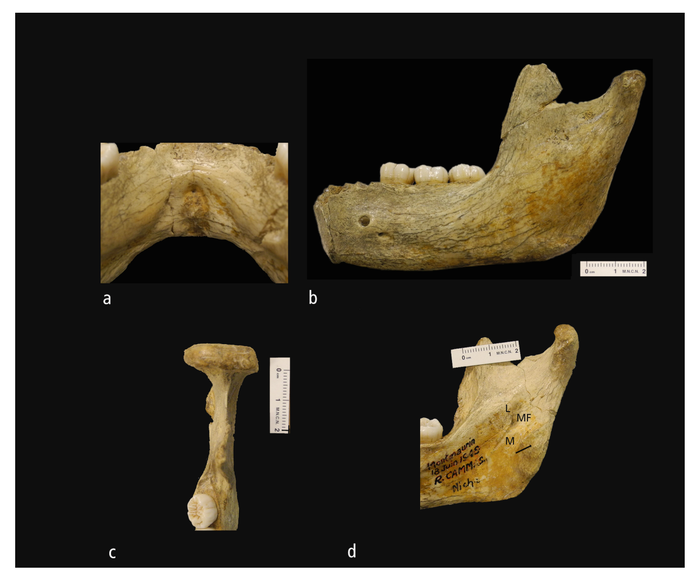
Fig 2. Different morphological aspects of the Montmaurin-LN mandible. a) Internal aspect of the symphysis, showing the fossa genioglossa; b) Left view of the mandible. Note the receding wall of the symphysis, the position of the mental foramen, the flat surface of the corpus and ramus, and the regular gonion profile; c) Detail of the mandible showing the medial position of the mandibular notch rim on the condylar process; d) Internal aspect of the right ramus. Note the low position of the mylohyoid line with regard to M3, the small but almost horizontal geometry of the retromolar area, the presence of a medial pterygoid tubercle (arrow), mandibular foramen (MF), the lingula (L), or the large distance between the end of the mylohyoid groove (MG) and M3. Scale bar in b, c, and d, is 2 cm.

https://doi.org/10.1371/journal.pone.0189714.g002