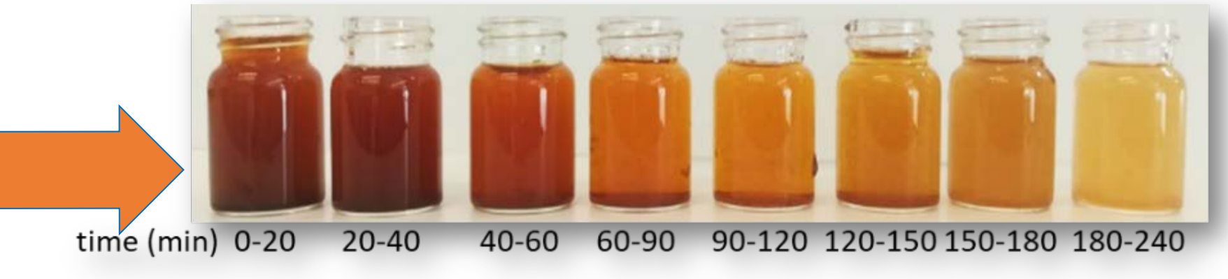
Figure 3. BSG extracts obtained by SFW at 185 °C and different times.

BSG composition can vary due to several factors<sup>2</sup>. Biomass characterization has been carried out according to the NRLE protocols<sup>3</sup> (Table 1).