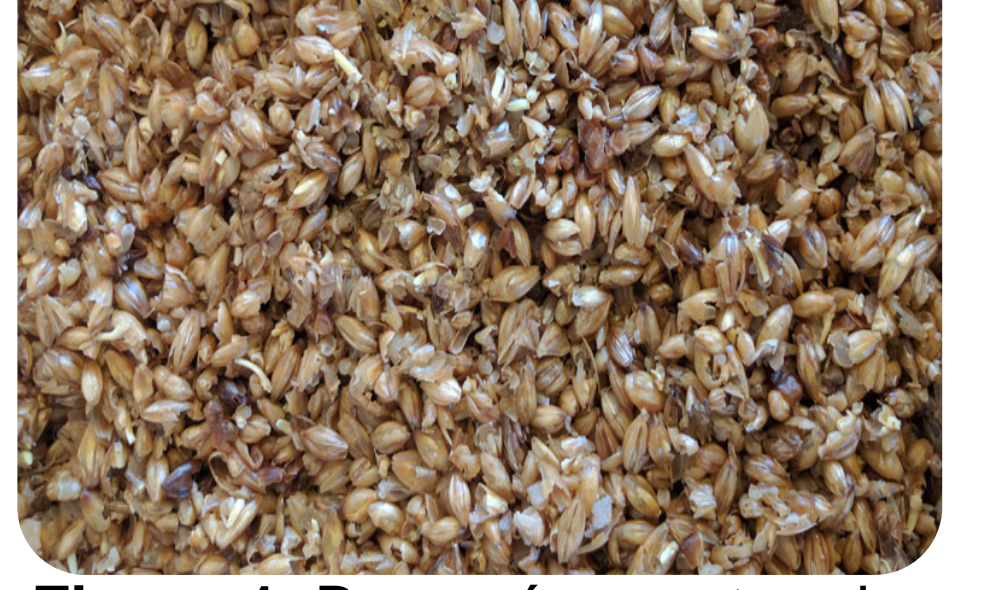
Figure 1. Brewer's spent grain.

BSG composition can vary due to several factors<sup>2</sup>. Biomass characterization has been carried out according to the NRLE protocols<sup>3</sup> (Table 1).