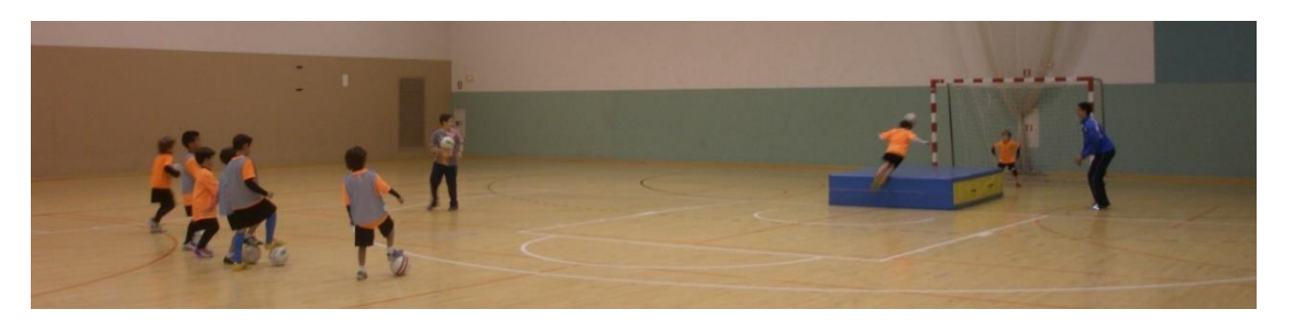
Figure 5. Award for a playful activity in which to make watermarks for a good training (Image taken on December 16).