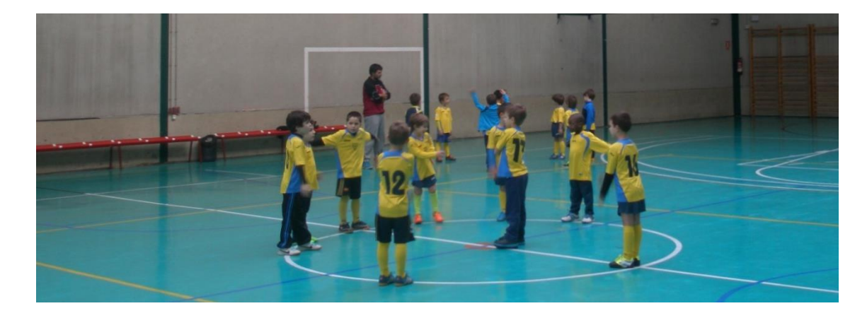
Figure 3. Players warm up autonomously and mechanically under the watchful eye of their coach (Image taken on January 8).

It is encouraged that the players, led by colleagues with more physical and social skills, are able to develop a warm-up autonomously, as a good habit useful for their future.