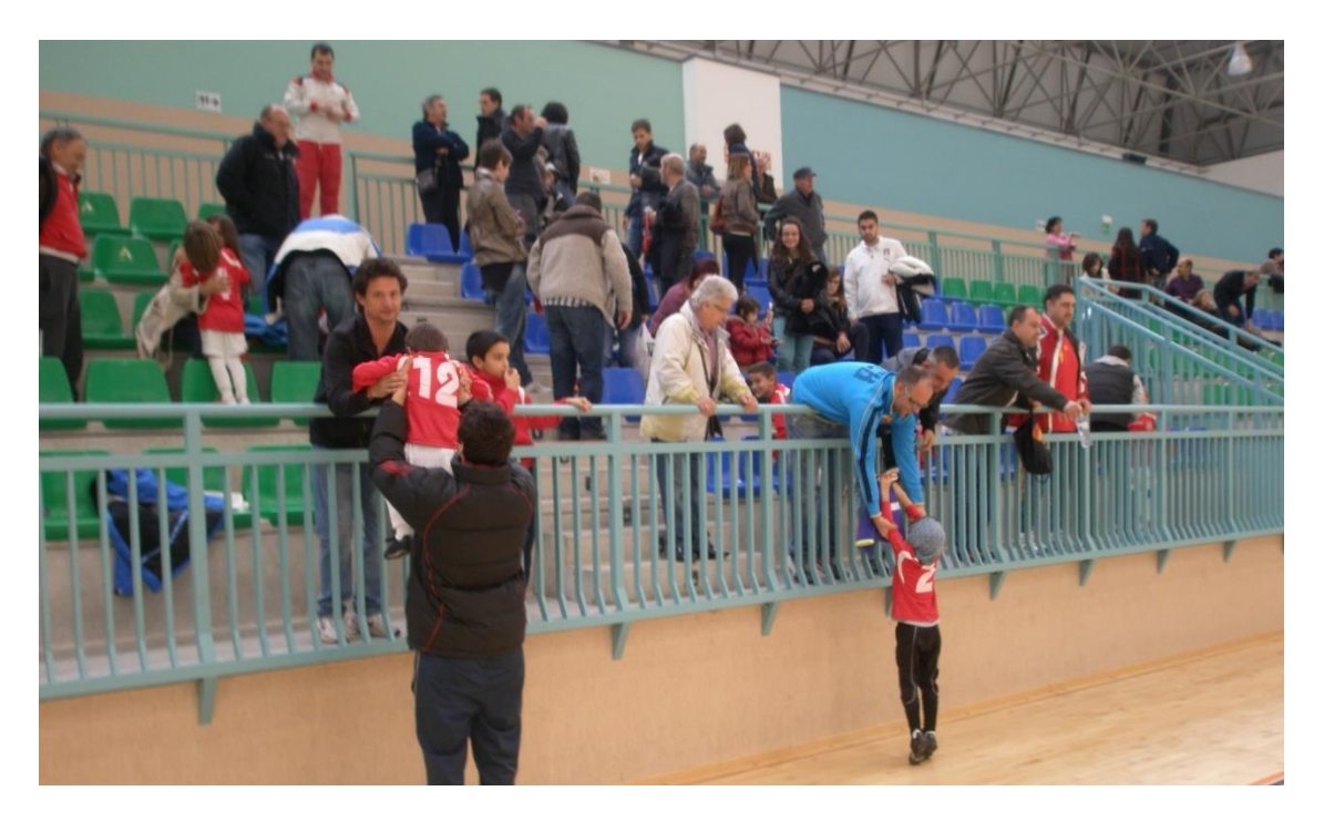
Figure 2. At the end of the game, family members lovingly pick up their children and help them change (Image taken on November 17).

The students leave the school one by one. Parents are waiting for you. They wear the school uniform. They have 15 minutes to take them to the locker room, give them a snack, get dressed for training and leave on time. (Field Diary: 719, December 16).