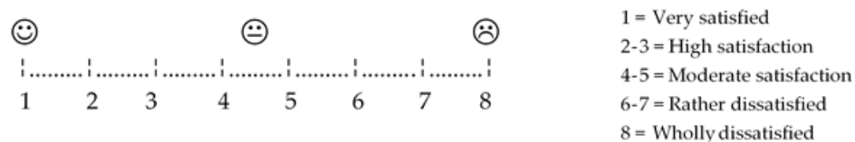
Figure 2. Likert-type scale with 5 score ranges. Satisfaction Scale.

In the case of the Stress Scale, 1 indicates not at all stressed, while 8 indicates extremely stressed. A score of 11 indicates very little or no stress, 12 to 37 low-stress levels, 38 to 62 moderate stress levels, 63 to 87 high stress levels, and a total score of 88 is considered extreme stress.