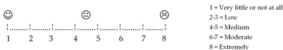
Figure 1. Likert-type scale with 5 score ranges. Stress Scale.

The responses were structured on a Likert-type scale ranging from 1 to 8. While a 5-point Likert-type scale would have been simpler, an 8-point scale widens the range of the responses to further lateralise them, avoids neutrality and reduces bias. In addition, the respondents had the option of writing an explanation their responses to each item. Subsequently, 5 score ranges were established to facilitate the interpretation of the results (Figures 1 and 2).