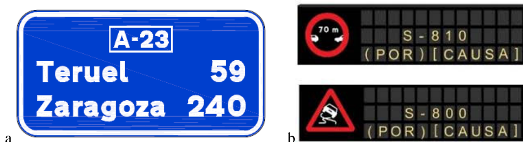
Figure 1: (a) Confirmation Sign (CS); (b) Variable Message Sign (VMS).

In Spain, electronic signals in the national territory are mainly exhibited in Variable Message Signs (VMS) with a hybrid matrix (Fig. 1b). VMSs inform about possible re-routings or variable events on the road (works, congestion, fog, snow; Arbaiza & Lucas, 2012), among others. Focusing on painted signs, the Confirmation Signs in particular (CS, Fig. 1a; S600 / S-699; BOE, 2014) have special relevance because they are frequently displayed on the roads, and are the main way drivers learn to locate places in the road network. The CSs constitute the reference matrix through which drivers understand and anticipate situations and events along the network.