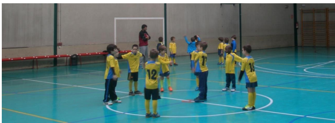
Figure 3. Players warm up autonomously and mechanically under the watchful eye of their coach (Image taken on January 8).

It is encouraged that the players, led by colleagues with more physical and social skills, are able to develop a warm-up autonomously, as a good habit useful for their future.