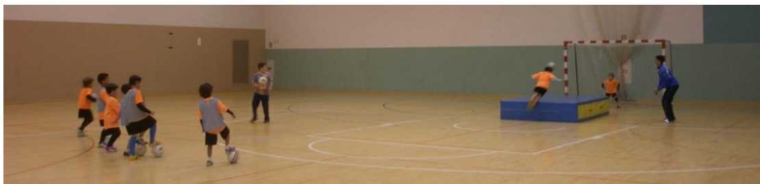
Figure 5. Award for a playful activity in which to make watermarks for a good training (Image taken on December 16).