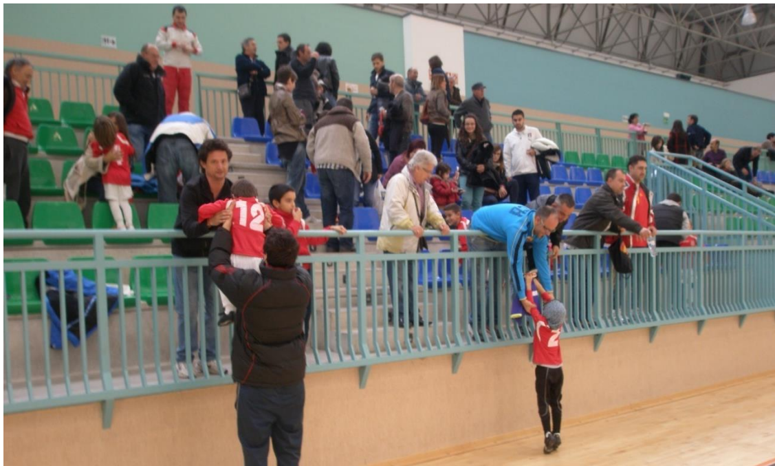
Figure 2. At the end of the game, family members lovingly pick up their children and help them change (Image taken on November 17).

The students leave the school one by one. Parents are waiting for you. They wear the school uniform. They have 15 minutes to take them to the locker room, give them a snack, get dressed for training and leave on time. (Field Diary: 719, December 16).