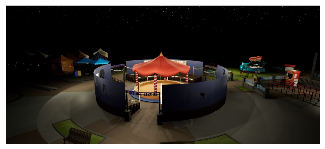
Figure 1: Virtual Circus scenario during the development phase

In addition, users can access more information by accessing the menu. The menu screen includes the controllers showing the function of each button, which is considered by White as an appropriate way of implementing a tutorial. This strategy of explaining the possible interactions does not interfere with advanced users, as they do not need this information. Additionally, it complies with Mayer's multimedia principle, pre-training principle, and coherence principle. If users do not know what to do, they may randomly press buttons hoping to succeed and continue playing. At a certain point, they will access the menu and discover tips on the controllers that may be helpful to them. The rest of the interface appears when users take too long to perform a specific task in which they are involved. A pop-up appears, giving them some tips according to the just-in-time instructions explained by White. Also, as a first contact with the task, a robot avatar shows the users how to perform it, following the cognitive apprenticeship method also explained by White. Furthermore, the instructions disappear as users progress, and if they do not know how to continue at some point, tips appear as pop-ups. These tips shown as pop-ups follow Mayer's theory by displaying information at the moment when needed (contiguity principle), avoiding repetition of information (redundancy principle), and having a simple design to avoid distractions (coherence principle), as it is shown in Figure 2.