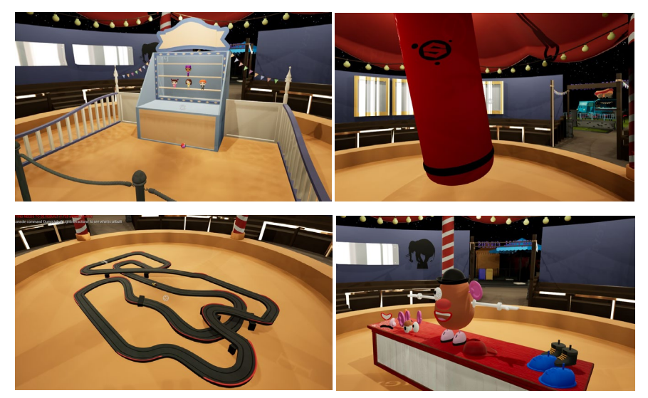
Figure 3: Levels of Virtual Circus: Strike the Toys, Punch Like a Tornado, Slot-Road, and Dress the Potato Up

Dress the Potato Up: Users will be rewarded with points and the ability to create special effects for the potato character if they dress it up completely by attaching a piece of clothing of each type. This level helps users master their abilities of grabbing and attaching items.